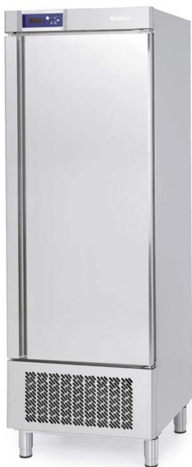
AN 501 T/F