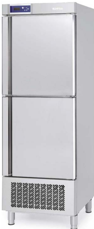
AN 502 T/F